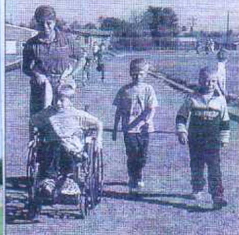
WEST KIDS ON THE FUNDRAISING TREK – (Photo by Audrey Blackwell/OBSE)