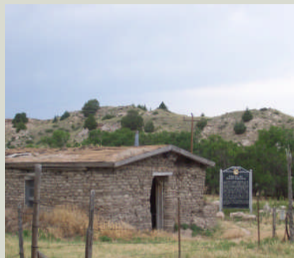
The pioneer spirit lives on in Nebraska from innovative soddies that once met the settler’s housing needs to today’s community projects and agricultural innovation in the new grant programs.