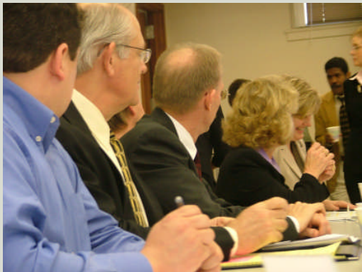
Commission meeting April, 2006

The Rural Development Commission is beginning to "turn heads". The new Building Entrepreneurial Communities and the Agricultural Innovation and Value-Added grant programs are raising the commission's visibility within the state and staff work on national committees is attracting attention at the federal level, too.